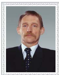
DR. SÁNDOR PINTÉR